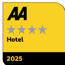
Highest ever 4-star rating for the hotel