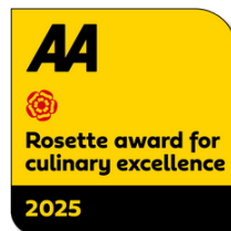
10th Consecutive Year of exceptional culinary service