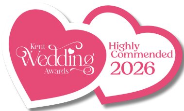
Wedding Venue of the Year (Traditional)

We are proud to be recognised as one of the leading coastal hotels in Kent, achieving prestigious accreditations and awards that celebrate our commitment to exceptional service, quality hospitality and unforgettable guest experiences.