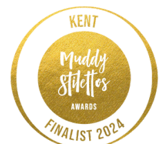
Best Hotel in Kent