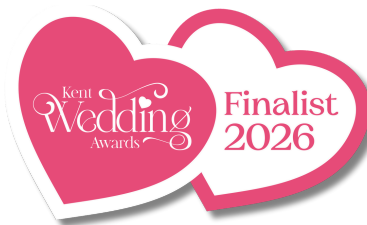
Wedding Venue of the Year Wedding Events Team of the Year Wedding Sustainability Award