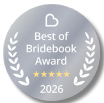
Silver Award Winner for receiving 5-star reviews from newly married couples in 2025